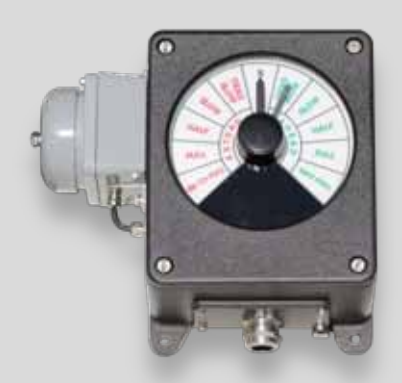
telegraph repeater round turning scale operation, In wall box with bell