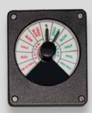
round tourning scale operation to be flush mounted

sm electrics' Engine Order Telegraph unit installed at the main engine local station operates during "EOT operation mode" in correspondance with the main EOT on centre bridge. The manoevre commands from bridge are indicated visually incl. audible alarm and have to be acknowledged accordingly. The acknowledgement will be transferred to the bridge as a responding action.