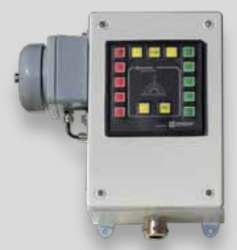
telegraph repeater push button operation, In wall box with bell