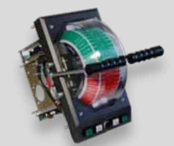
double engine order telegraph standard size, spade handle